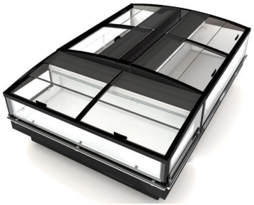
Remote cabinets HI2P Series