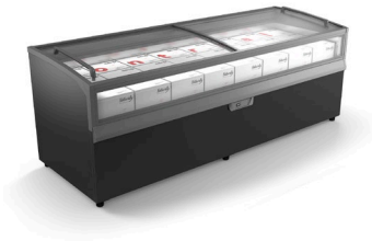
Chest freezers and chillers