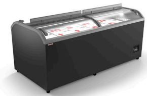
Ice cream freezers