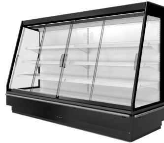
Semi Vertical HM00 Series