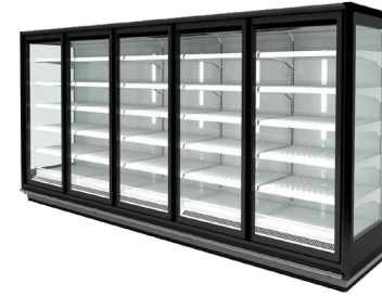
Freezer shelves HMOP Series