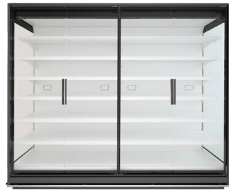
Multideck HM Multideck Series